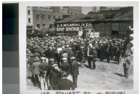
1934 International Longshoremen's Association and General Strike.